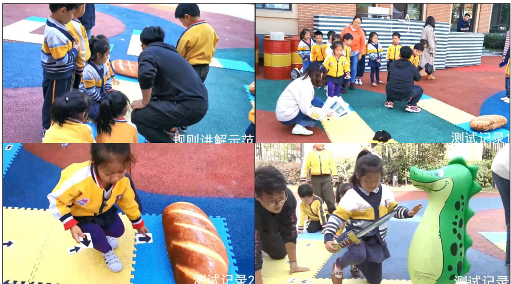
Figure 3. “Coding Adventure” Test screen in the kindergarten