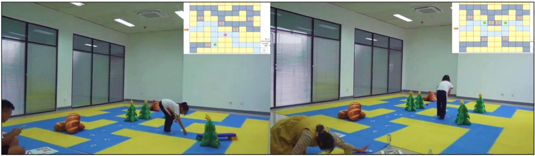
Figure 2. Test prototype “Coding Adventure”